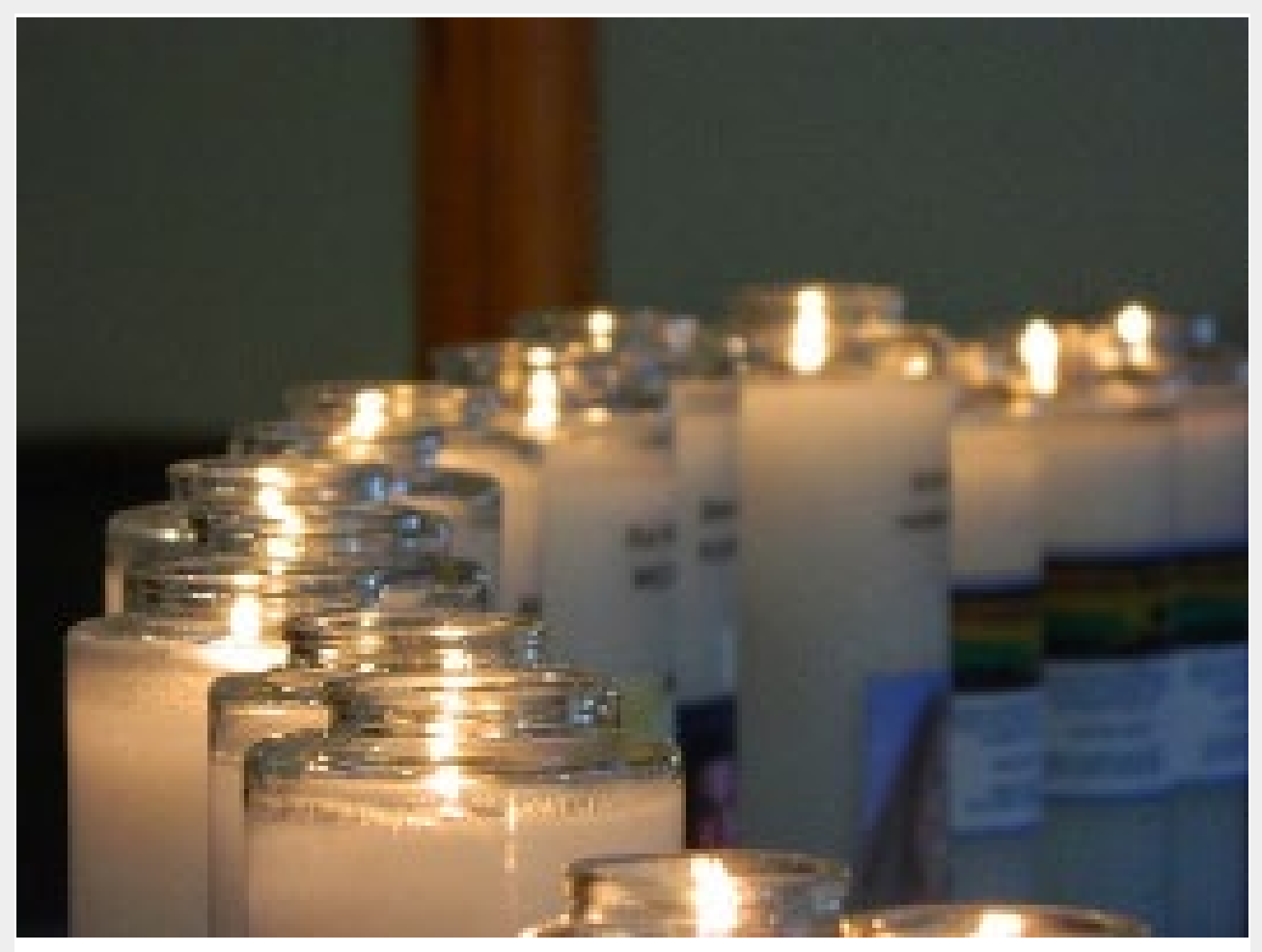
Serving the Spiritual Needs of Grieving Parents Whose Children of Any Age Have Died by Any Cause, No Matter How Long Ago

Your Emmaus Ministry Remote Retreat Guide June 20, 2020 9:30am EDT