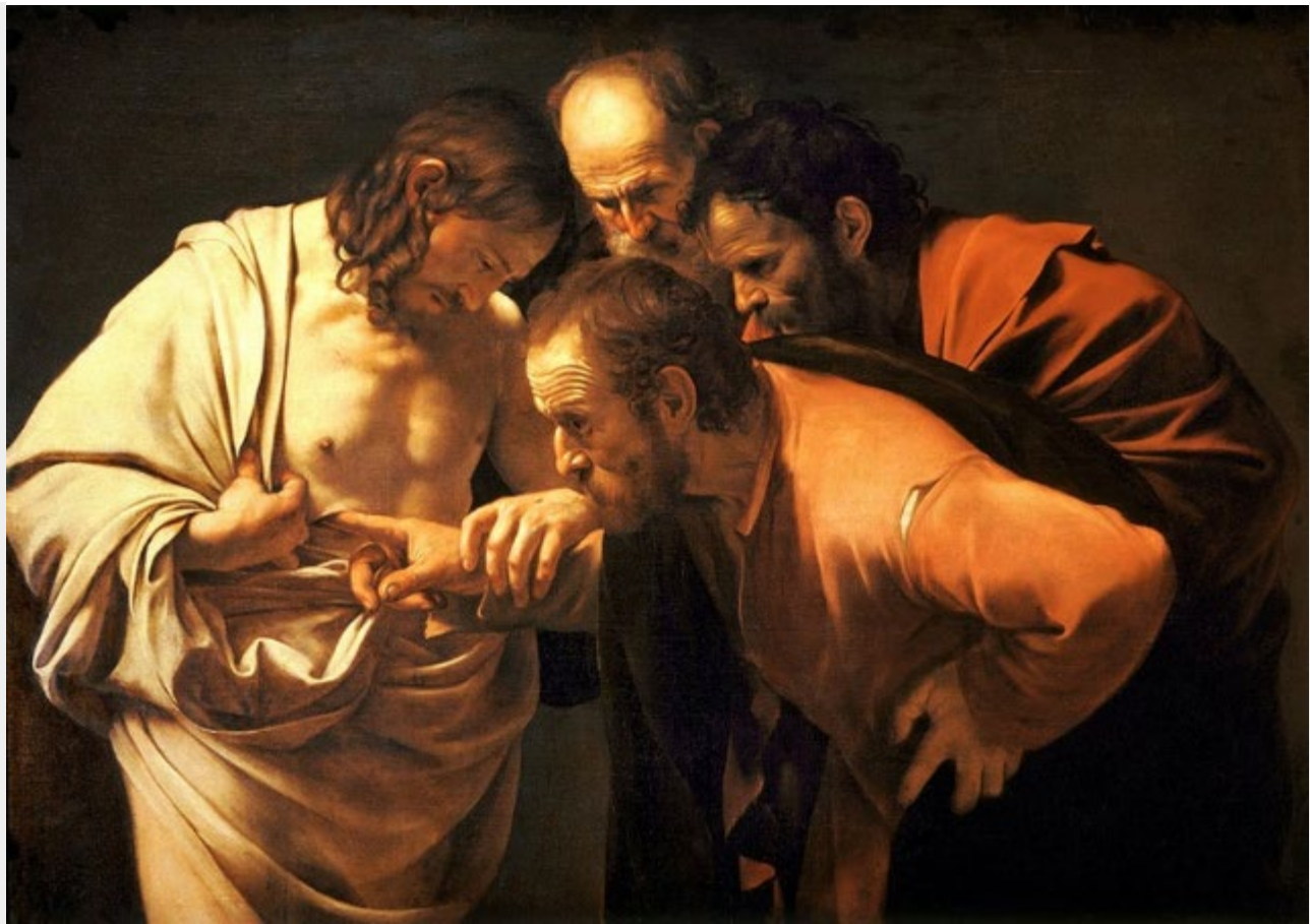
The Incredulity of Saint Thomas (Michelangelo Merisi da Caravaggio)