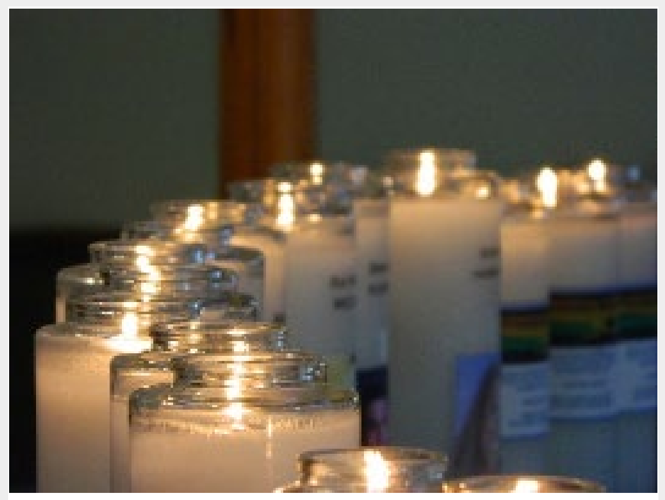
Serving the Spiritual Needs of Grieving Parents Whose Children of Any Age Have Died by Any Cause, No Matter How Long Ago

Your Emmaus Ministry Remote Retreat Guide August 15, 2020 9:30am EDT (or a convenient time for you)