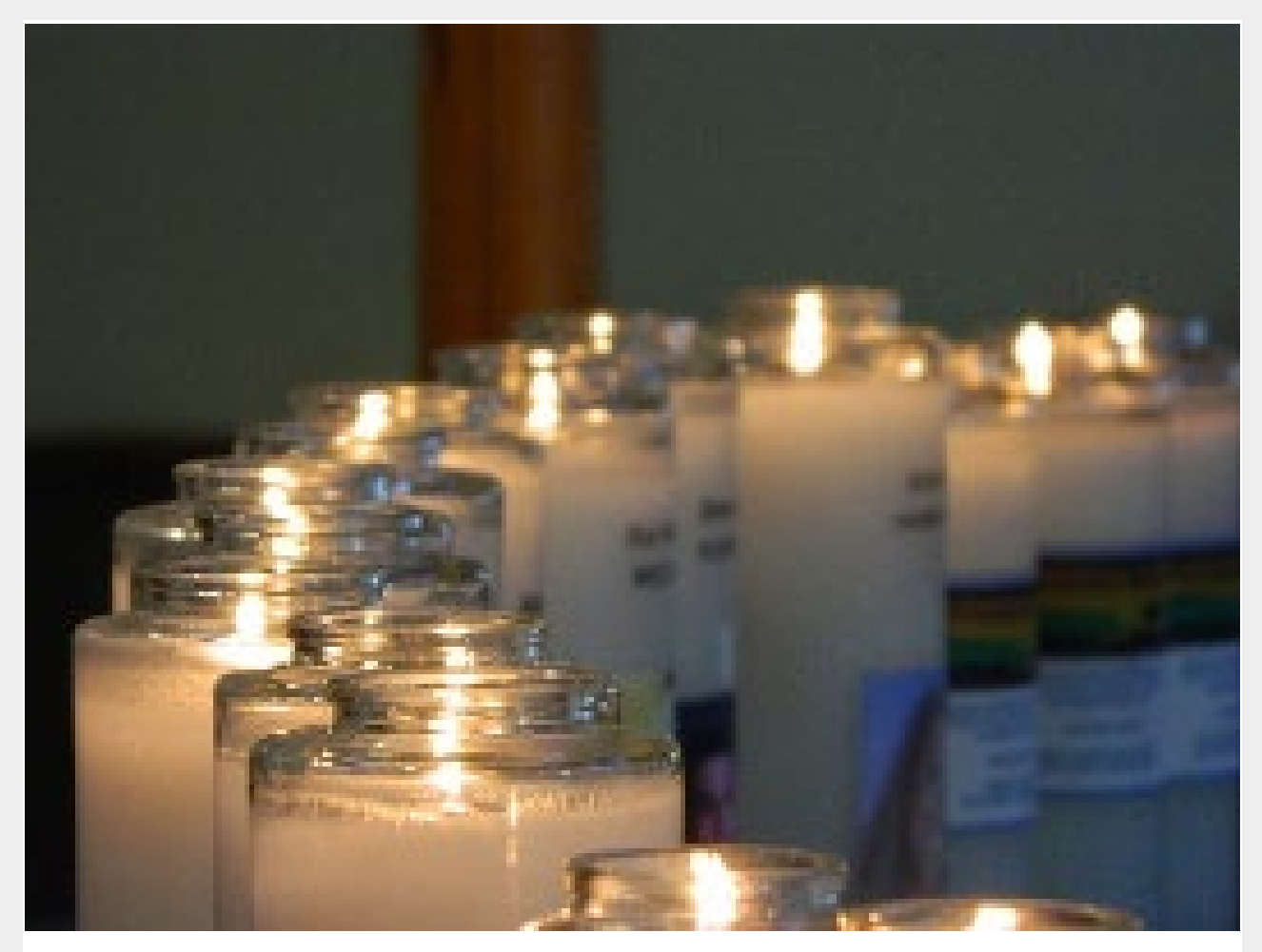
Serving the Spiritual Needs of Grieving Parents Whose Children of Any Age Have Died by Any Cause, No Matter How Long Ago

Your Emmaus Ministry Remote Retreat Guide October 24, 2020 9:30am ET