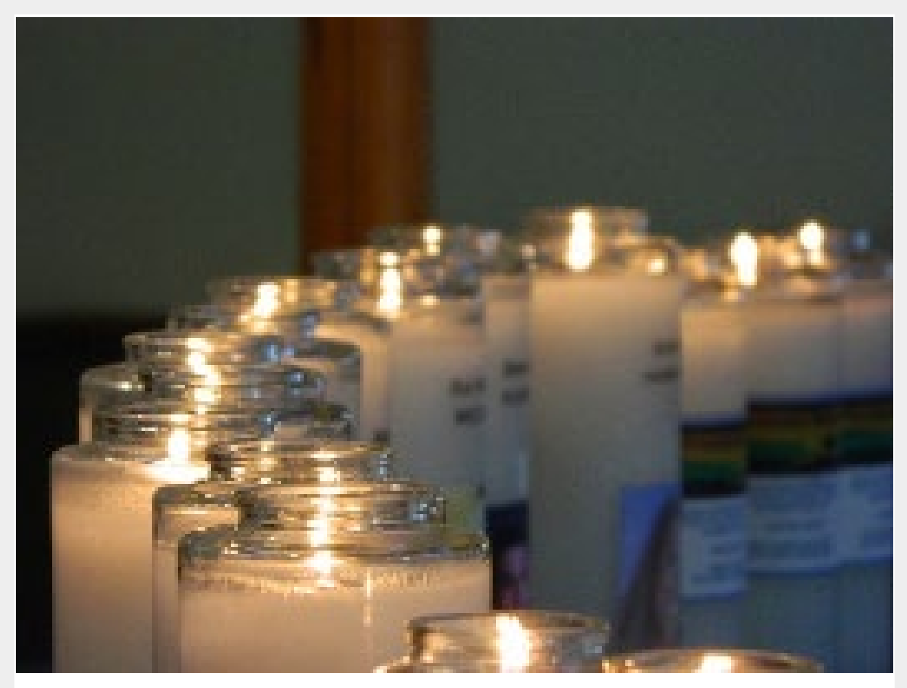
Serving the Spiritual Needs of Grieving Parents Whose Children of Any Age Have Died by Any Cause, No Matter How Long Ago

Your Emmaus Ministry Remote Retreat Guide October 31, 2020 9:30am ET