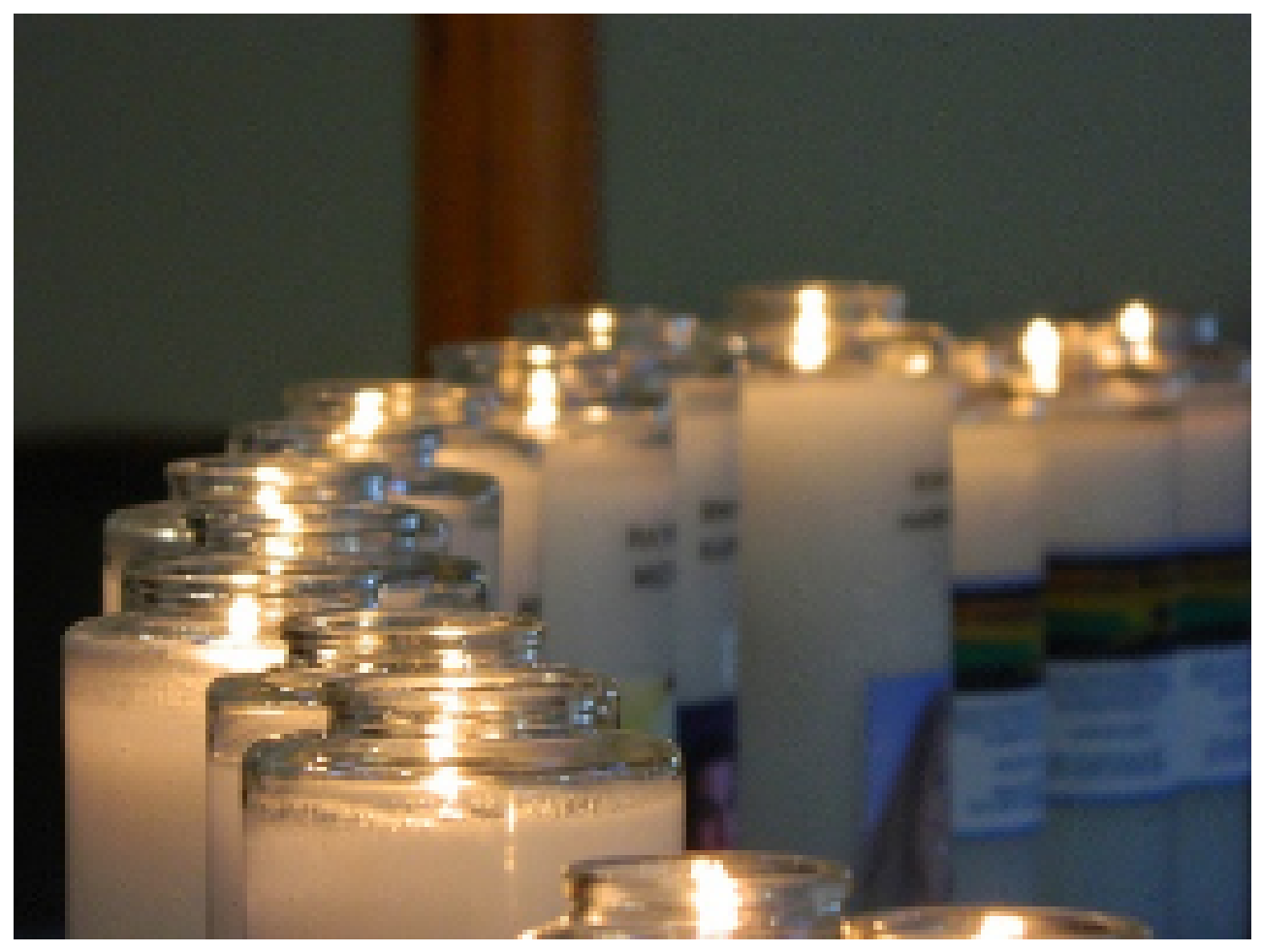
Serving the Spiritual Needs of Grieving Parents Whose Children of Any Age Have Died by Any Cause, No Matter How Long Ago

Your Emmaus Ministry Remote Retreat Guide April 17, 2021 9:30am ET