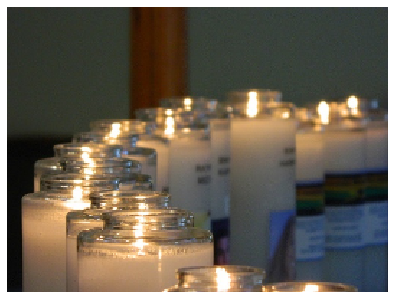
Serving the Spiritual Needs of Grieving Parents Whose Children of Any Age Have Died by Any Cause, No Matter How Long Ago

Your Emmaus Ministry Remote Retreat Guide July 10, 2021 9:30am EDT