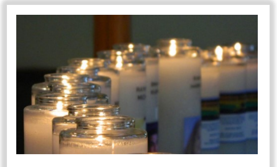
There are no words for a grieving parent whose precious child has died.

even in death; and to rejuvenate my relationship with God after I've been so angry and indifferent towards him for so long."